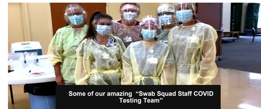
Some of our amazing "Swab Squad Staff COVID Testing Team"